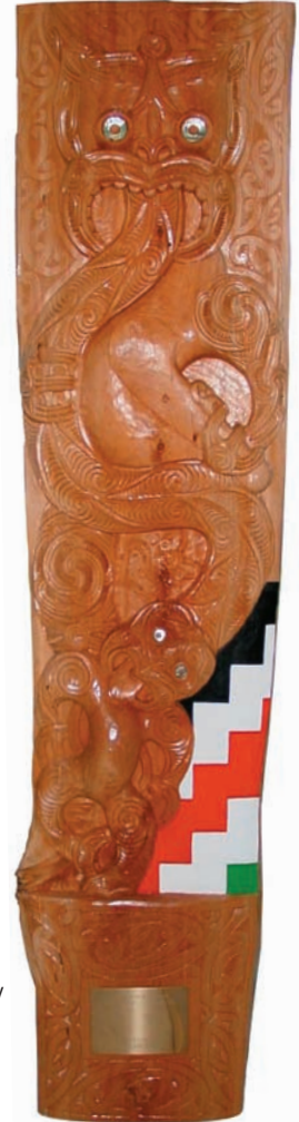
Counties Manukau District poupou

In 1987, te reo Māori was declared an official language of Aotearoa/New Zealand.