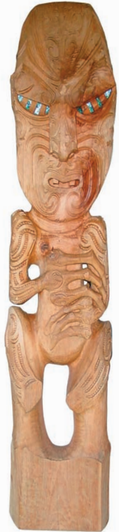
Eastern District poupou

A number of officers during the 1992 Police Traffic merger were given approval to be attested on the Paipera Tapu (Māori translated Bible) and to have the oath or affirmation read to them in Māori. Since then a number of officers have elected this form of attestation.