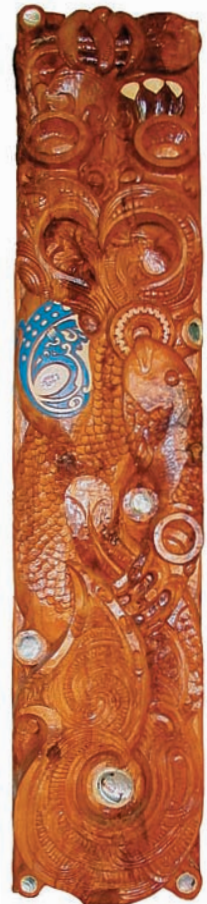
Waikato District poupou

Religious services are often delivered in te reo Māori (the Māori language) and many Māori cultural elements (such as waiata) form part of church services.