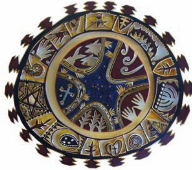
Title: O le fe tu, O le fatu The star, the seed

The above art works are currently at the Royal New Zealand Police College Chapel of Peace. The artist Michael Tuffery incorporated certain symbols acknowledging respective religious, philosophical and cultural practices. The dove and olive tree branch which he placed as the central element, are encompassed by obvious symbolism of north, south, east and west, which by we and/or our ancestors migrated from our respective lands of origin. Strongly referenced too are elements of the land and unique environment that we live in today, Aotearoa. The colours used are representative of the natural physical elements; fanua (land), moana (sea), rangi (sea), fetu (star) and ra (sun).