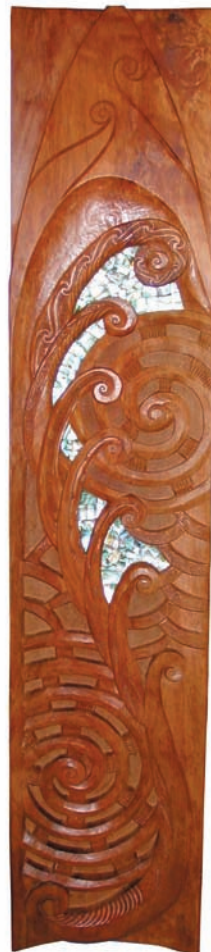
Tasman District poupou

Māori social life was based primarily around the whānau (family) while political activity was practiced mainly at the hapū (sub-tribe) level. Each hapū had a clearly-defined territory and was under the control of a chief (rangatira). The various whānau of the hapū lived within this territory. When threatened, or for other political purposes, hapū would join forces under the collective umbrella of the iwi (tribe).