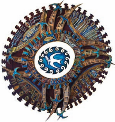
Title: O le la The sun